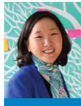
Kyungnan Park WFP Representative in Ecuador

We have learned from the people we work for: their hard work, creativity and dignity are visible in these pages. It is now our turn to share what we have learned.